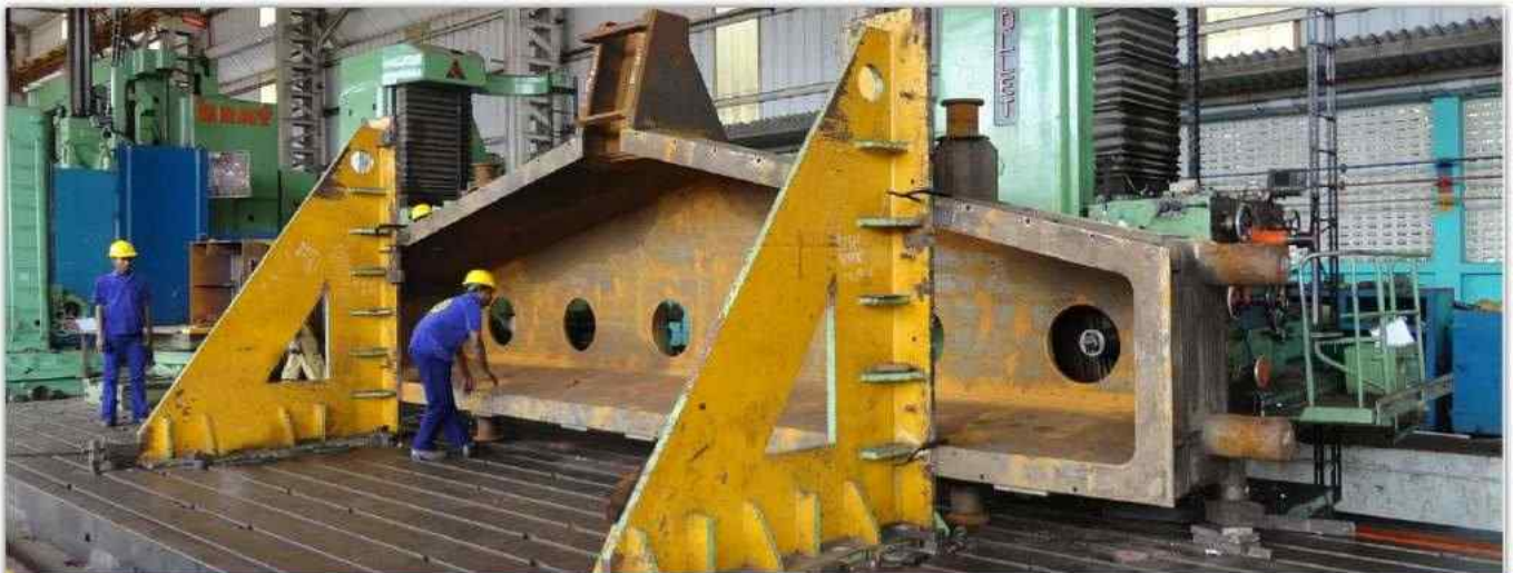
Twin Column Horizontal Boring Machine