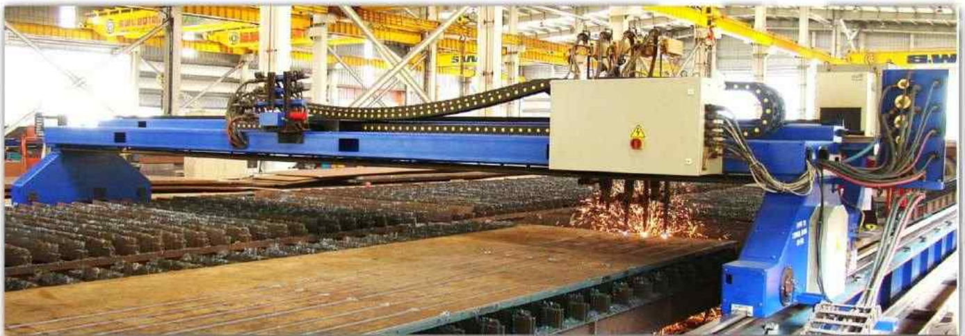
CNC - Messer Profile Cutting Machine (Gas / Plasma)