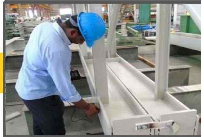
Painting DFT Check