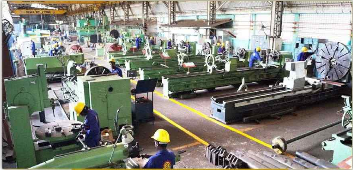
Machine Shop - I