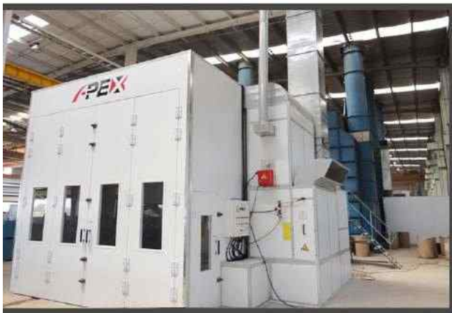
Painting & Baking Booth