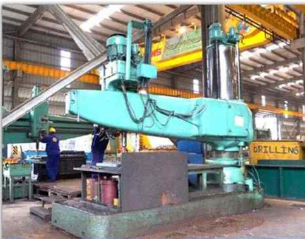
Radial Drilling Machine