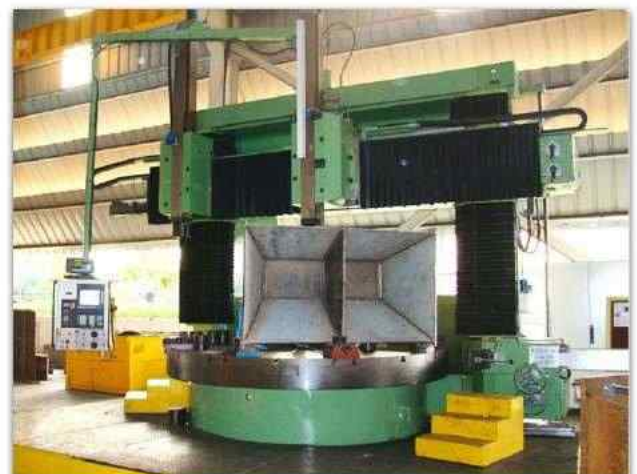
CNC VTL Machine