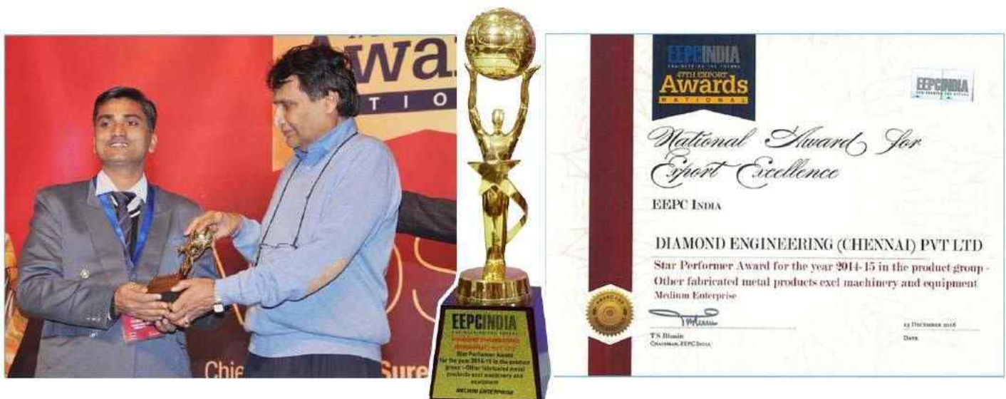
Dimond Group Receives EEPC Star Performer Award From Shri Suresh Prabhakar Prabhu, Union Minister Of Railways, Govt. Of India