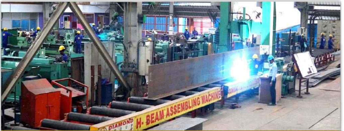
H-Beam Fitup Machine