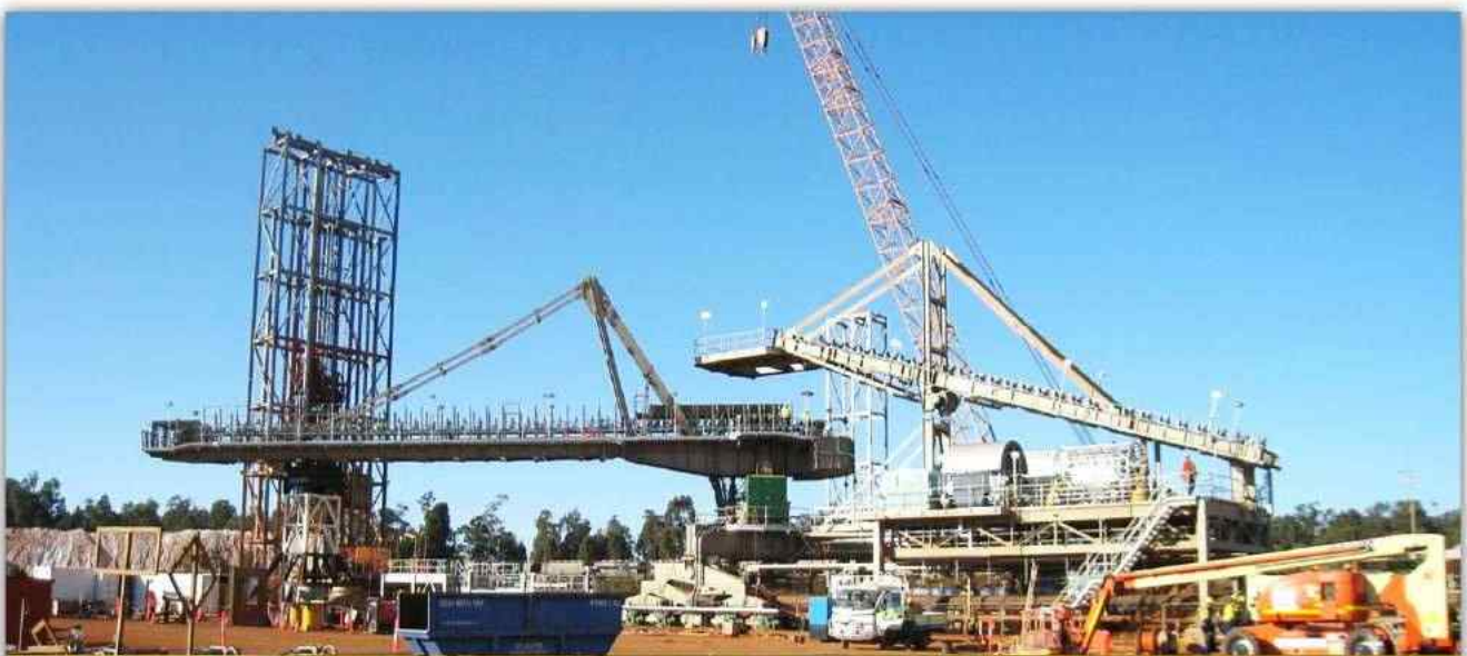
Stacker & Reclaimer