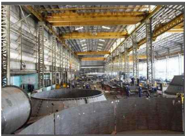
Fabrication Shop 5