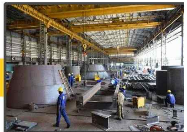
Fabrication Shop 6