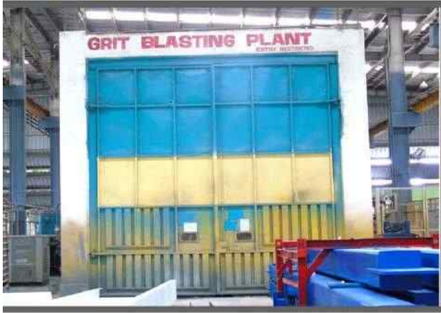
Grit Blasting Booth