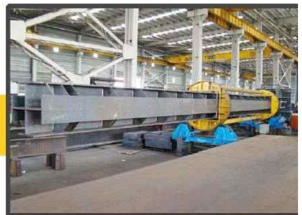
Column Welding Positioner