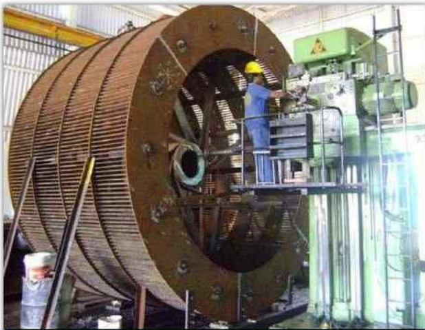
Collet Boring Machine