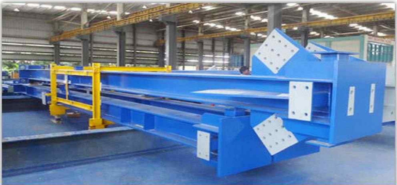
ESP Supporting Structure