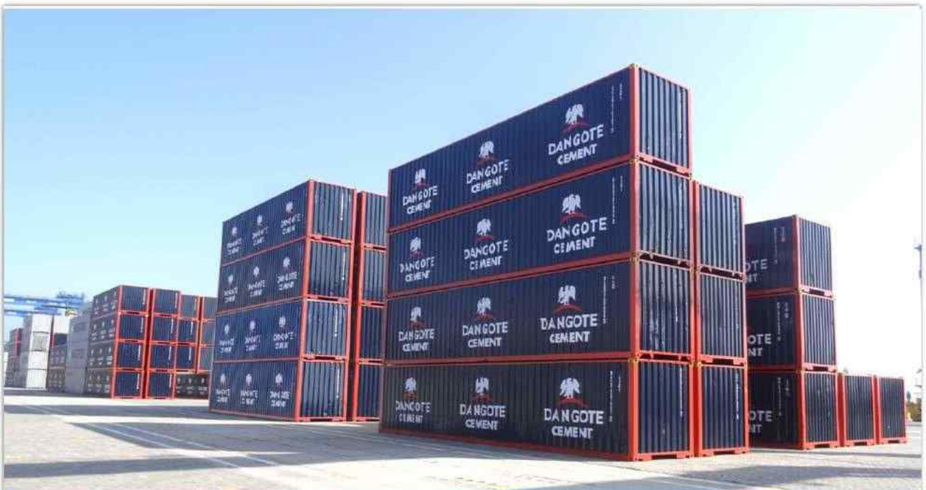
Container at Harbor