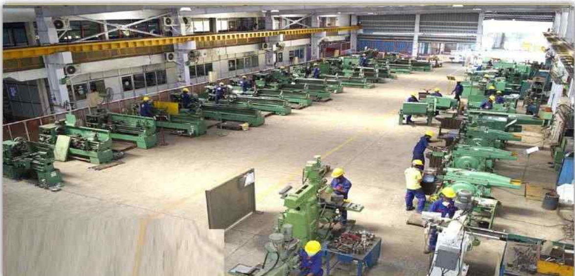
Machine Shop - III