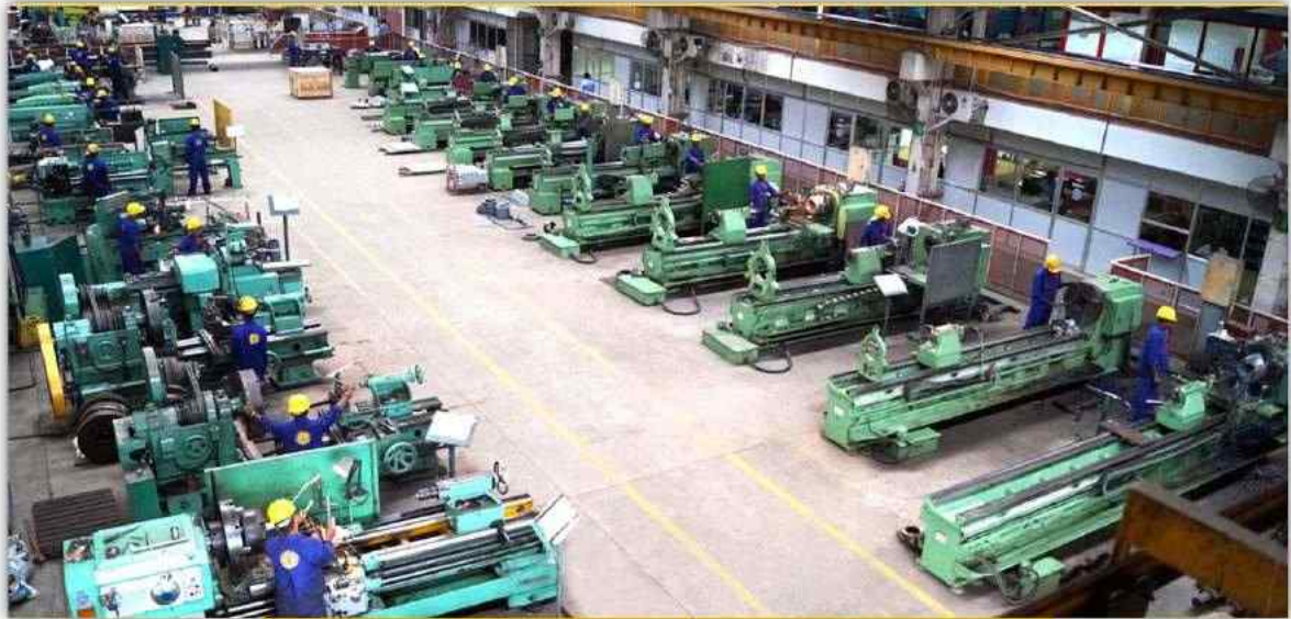
Machine Shop - II