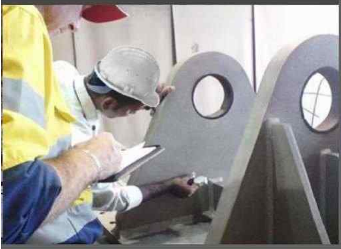
Blasting Surface Finish Check