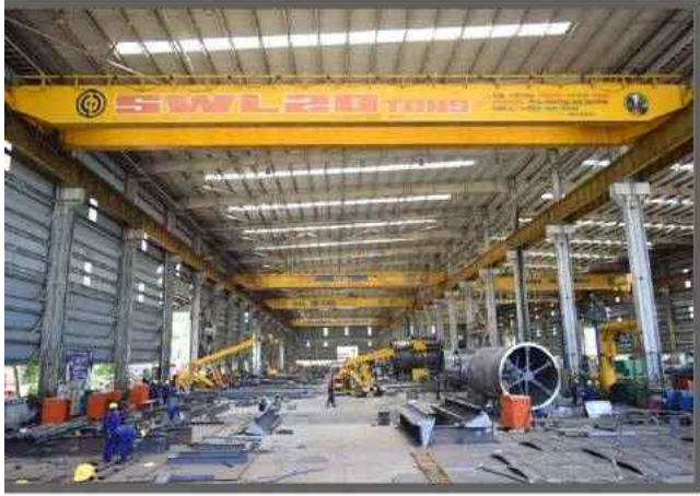
Fabrication Shop 1