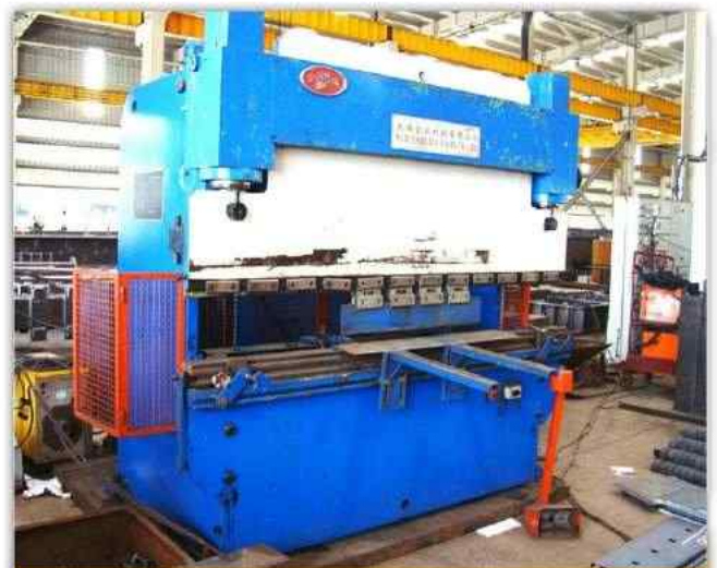
Press Brake Machine