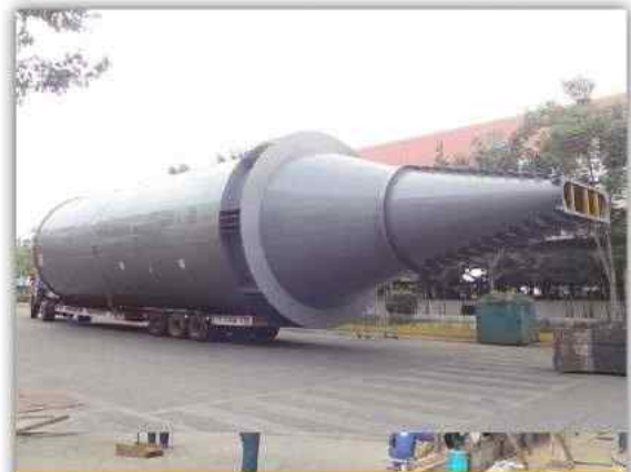
Air Product Bin