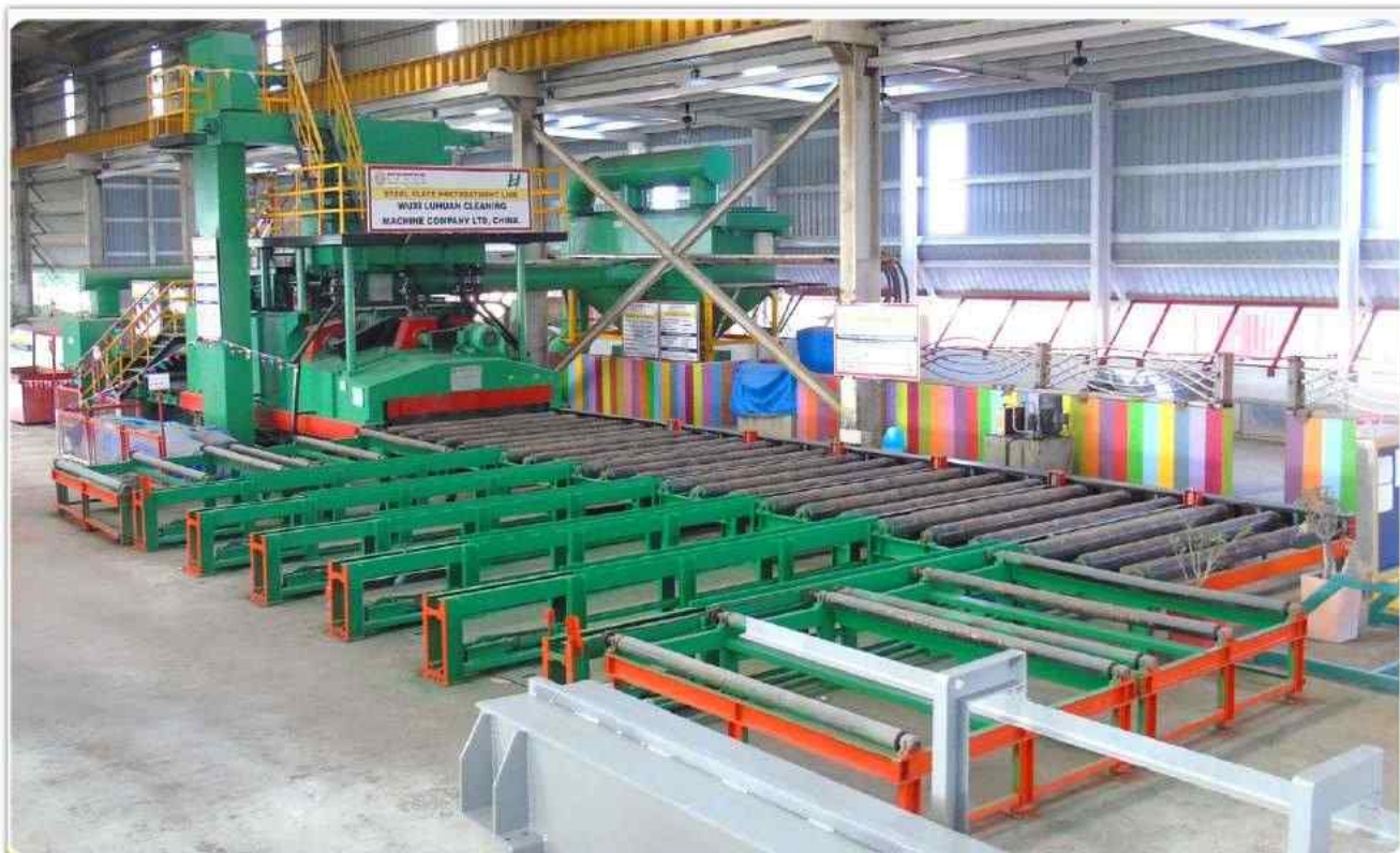
Steel Plate Pre-Treatment Line