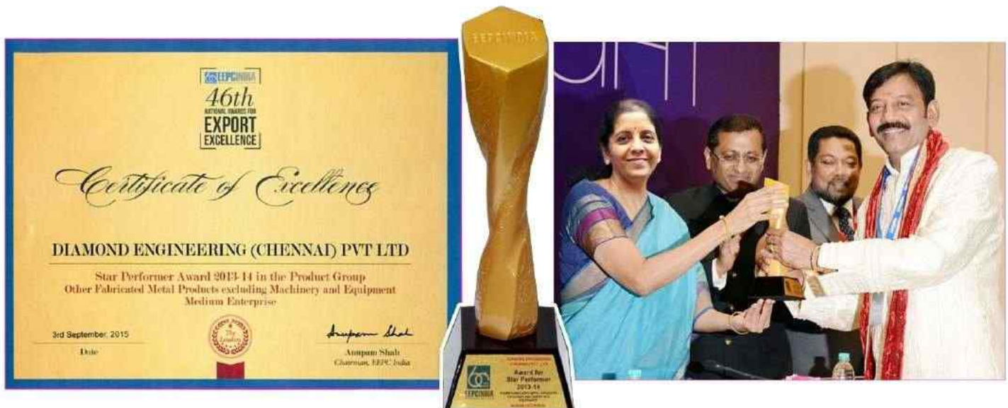
Dimond Group Receives EEPC Star Performer Award From Smt. Nirmala Sitharaman, Minister Of State For Commerce & Industry, Govt. Of India