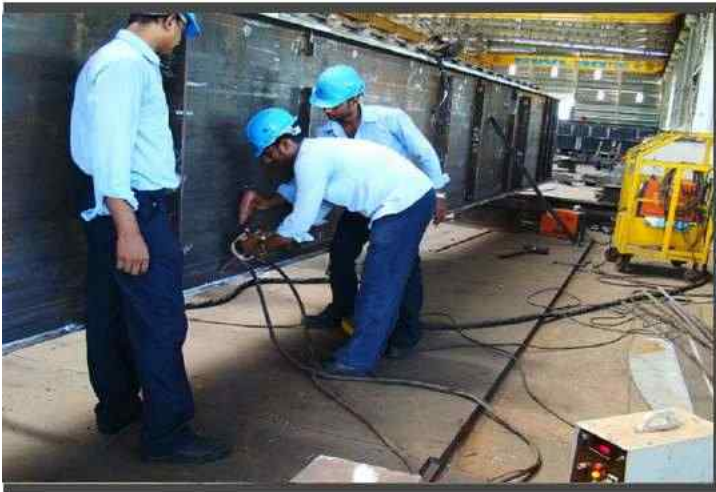
Magnetic Particle Test