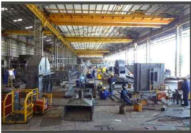
Fabrication Shop 3