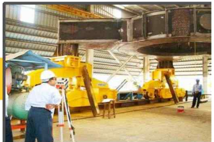
Optical Level Cheking