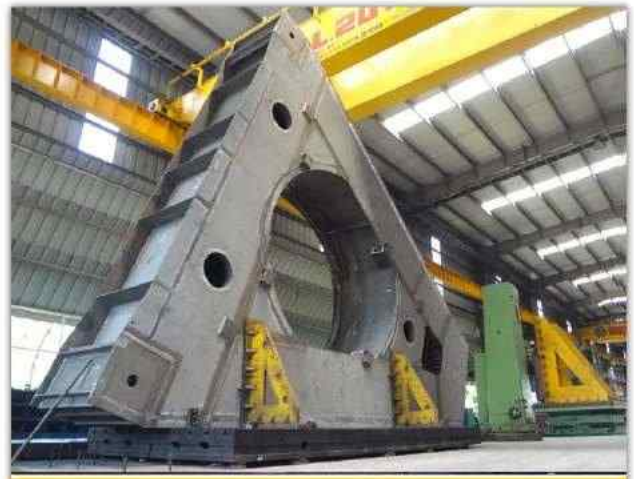
Horizontal Boring Machine