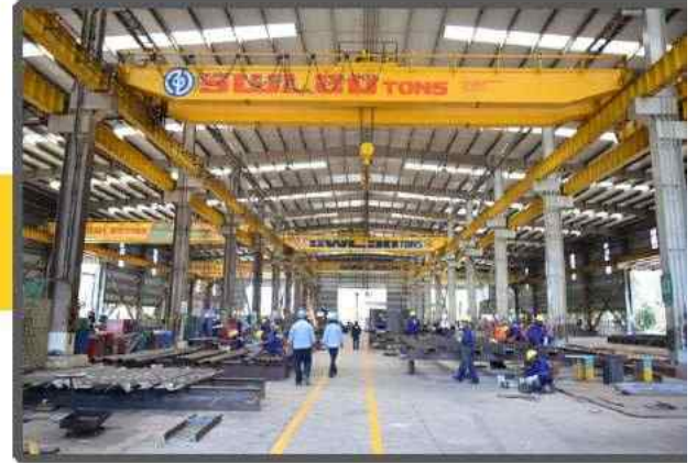
Fabrication Shop 2