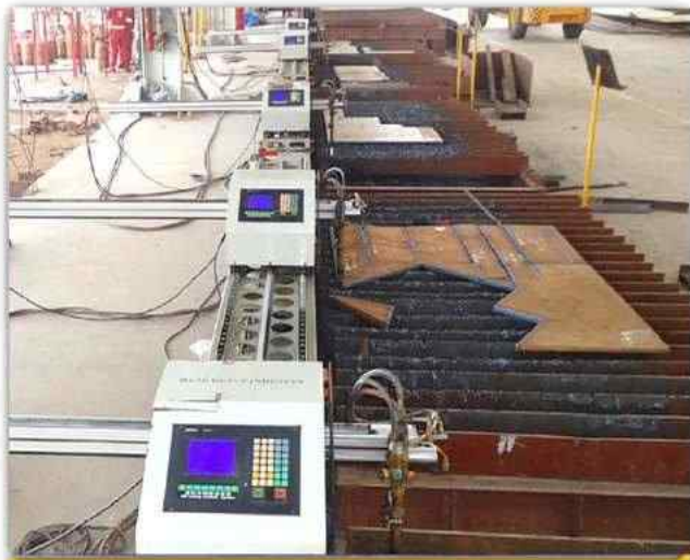
CNC - Portable Cutting Machine