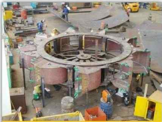
Bucket Wheel for Stacker