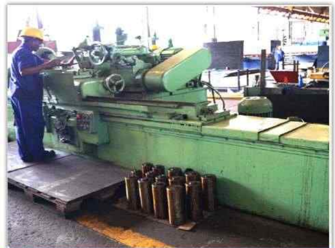
Cylindrical Grinding Machine