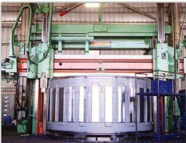
Vertical Turret Lathe Machine