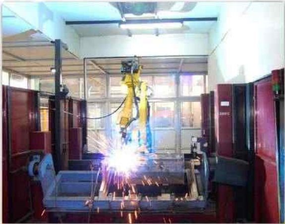
6 Axis Robotic Welding Machine