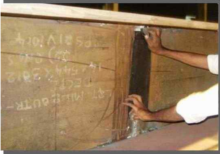
Radio Graphic Test