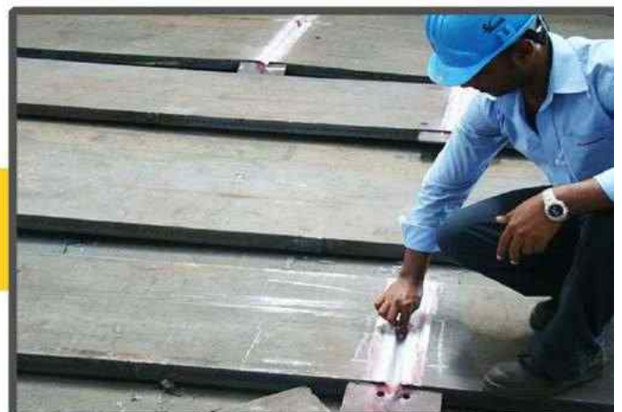
Liquid Penetrant Test