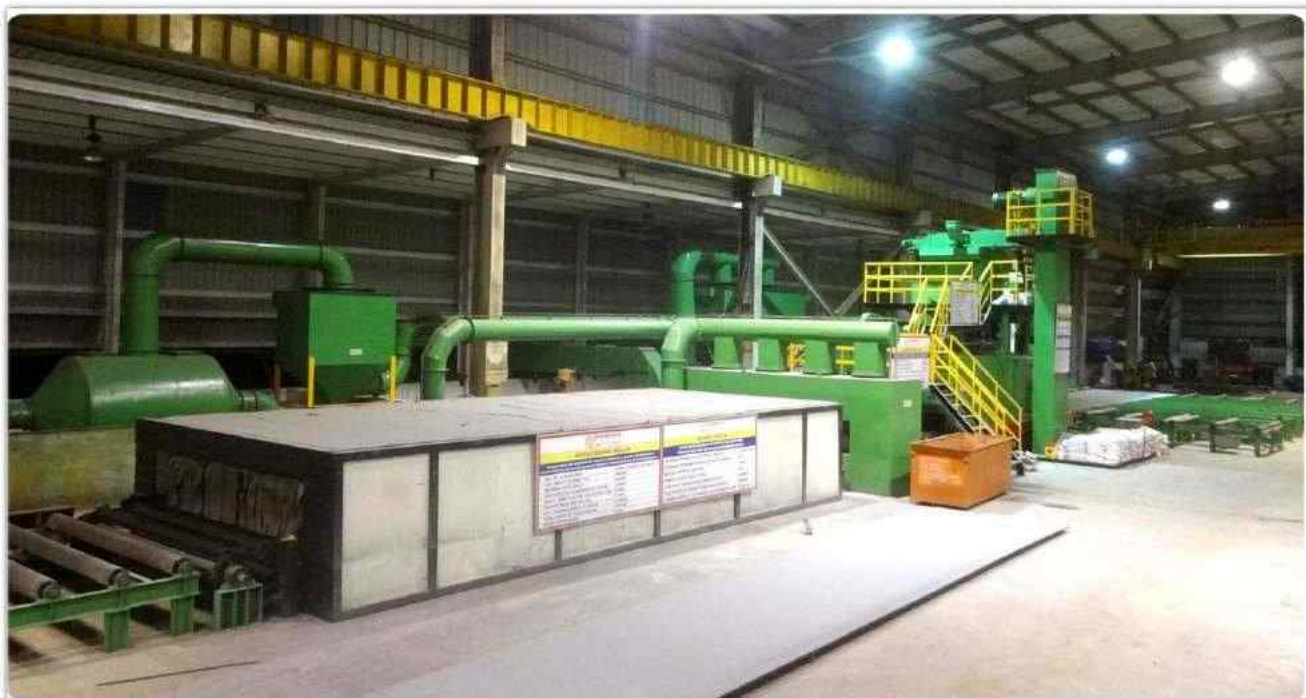
Steel Plate Painting & Drying Line