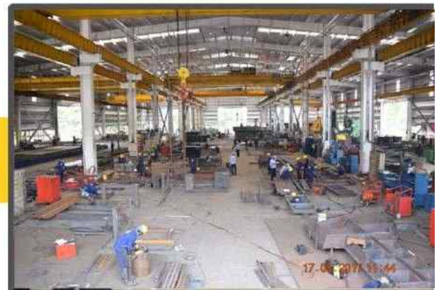
Fabrication Shop 4